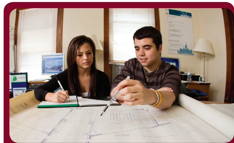
More than 80 Eastern students have gained valuable green collar job career experiences serving as interns at ISE.

In 2011, ISE provided technology training for more than 200 local code officials and building inspectors on Geothermal Exchange Heating and Cooling, Solar Photovoltaic and Solar Thermal Systems. Funding for this initiative came from the American Recovery and Reinvestment Act for training incumbent workers.