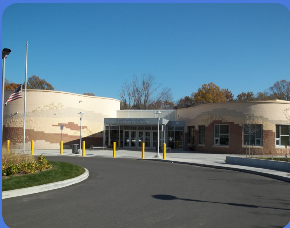
The Interdistrict Discovery Magnet School in Bridgeport, CT is a LEED Silver Building.