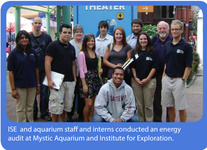
ISE and aquarium staff and interns conducted an energy audit at Mystic Aquarium and Institute for Exploration.

In 2009, the management at the Mystic Aquarium Institute for Exploration requested that ISE help their Energy Conservation Committee to develop a plan to “green the aquarium.” The process included facilitating a workshop for Mystic’s green team, collaborating to evaluate a sustainability plan, and conducting an energy study. Mystic’s green team has since made significant progress in improving energy efficiency and recycling. The combined Mystic Aquarium and ISE audit team is pictured to the left.