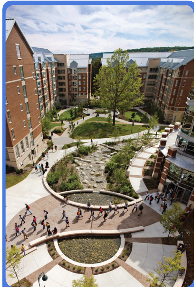
The bioswale located at the entrance of Eastern’s LEED Silver Science Building

Eastern is taking a comprehensive approach to evolve into a sustainable, energy efficient campus. Eastern’s Facility Management Department and the Center for Sustainable Energy Studies have been instrumental in creating specific initiatives to promote sustainability on campus. Initiatives include: the development of a sustainable energy studies program; retrofitting existing buildings with new efficient technology; installing a geothermal system in the High Rise residential hall; completing four new buildings designed to LEED standards (shown above); installing renewable energy systems; and creating a plan to reach zero carbon by 2050. ISE has also assisted Southern and Western Connecticut State Universities in preparing similar plans.