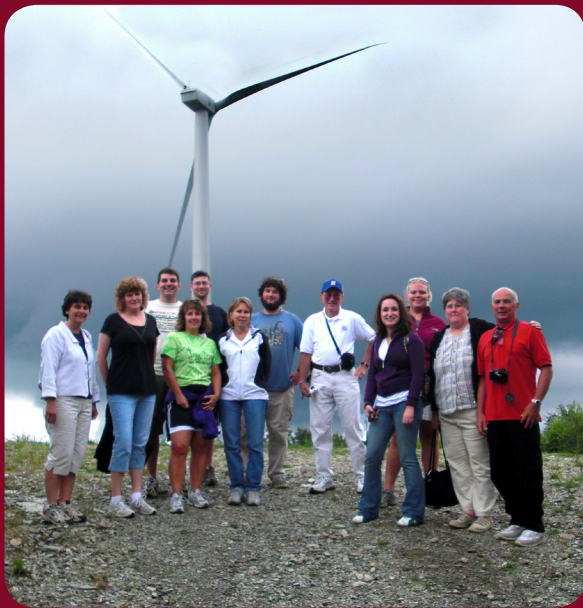
Teacher training includes summer field trips to key energy sites around New England, including Millstone Point generating station, ISO New England, and the wind turbine at Jiminy Peak (as shown above) in 2008.

To develop the Connecticut Energy Education programs, ISE manages a stakeholder process. ISE staff and members of the educational community developed the grade 9-12 energy and environmental education curriculum in support of the current Connecticut Department of Education's Science Framework. This process brings together representatives of key constituencies, including educators, science supervisors and energy experts. Connecticut Energy Education provides teachers with lessons and resources which encourage students across the state to learn how energy use impacts us all.