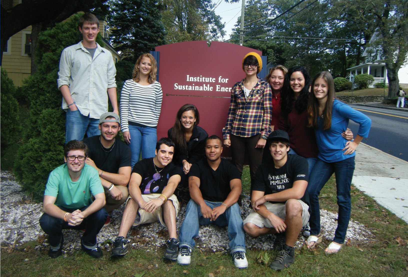
Current ISE student interns, October 2011