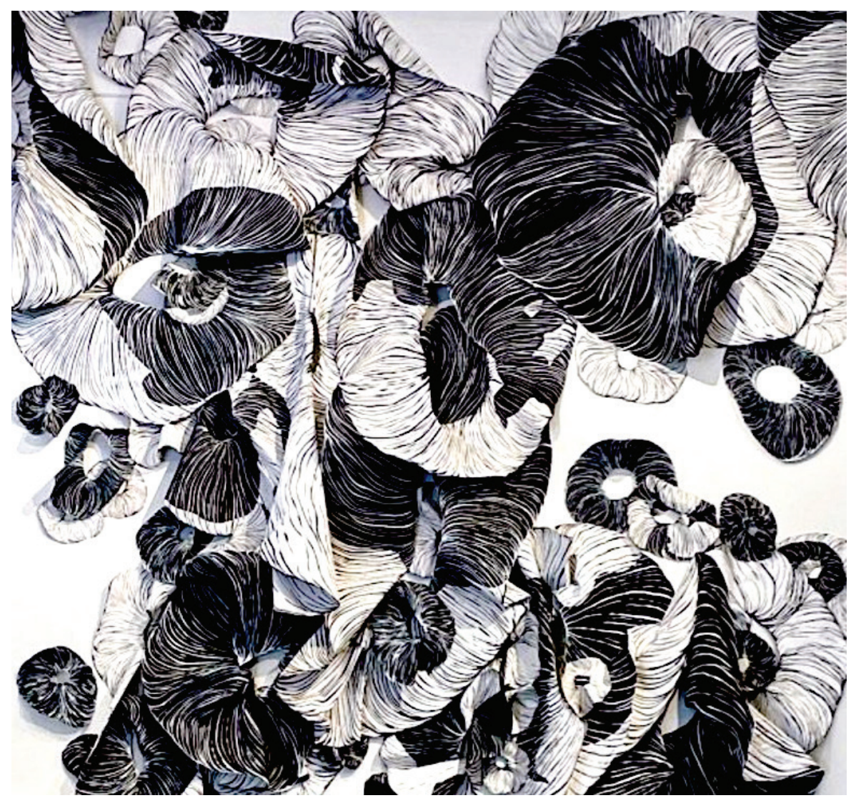
Maggie Nowinski, Untitled Cairn, India ink, high flow and acrylic gouache on canvas, site specific installation, 2024.